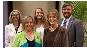
PANO 2014 Staff