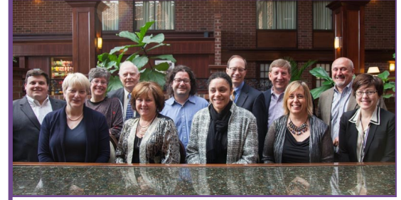
PANO 2014 Board of Directors

PANO wishes the following board members a fond farewell and deep appreciation for their guidance and assistance through the organization's leadership transition: